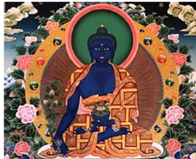
Medicine Buddha Practice