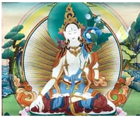
White Tara Practice